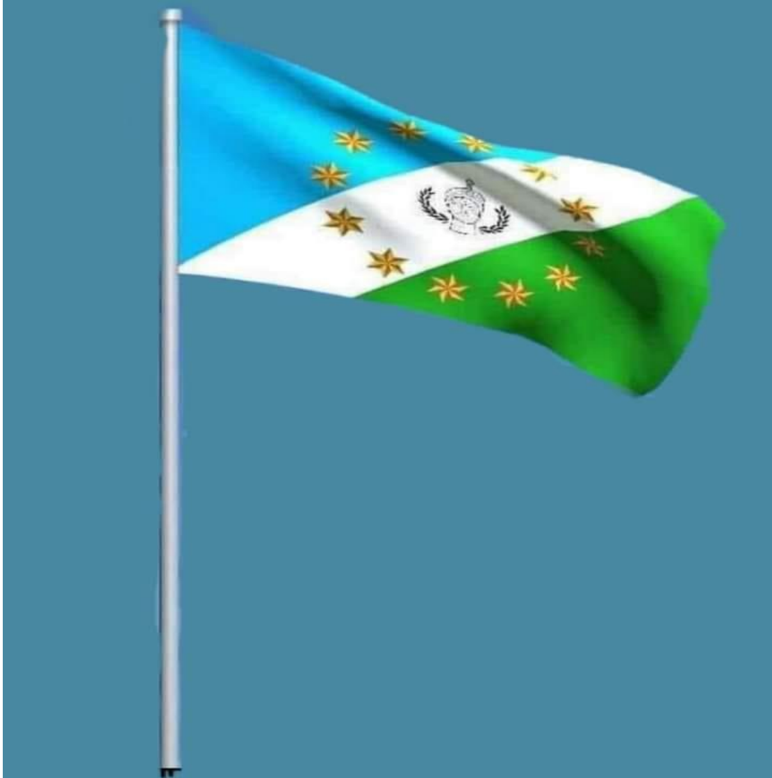
Yoruba National Flag

Blue stands for greatness, as sky is above the earth so shall Yoruba nation stand above her enemies.